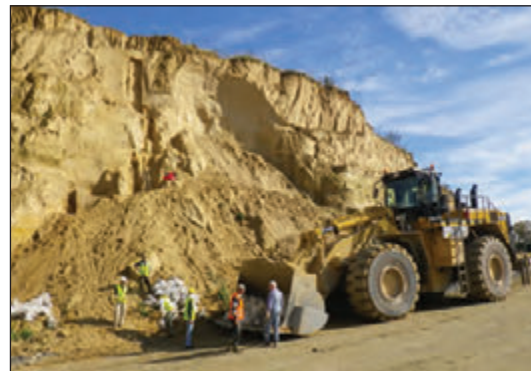
Nussloch, Allemagne © P. Antoine