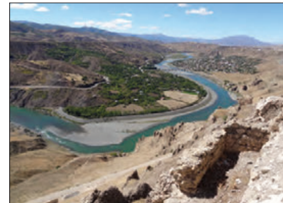
Palu, Anatolie